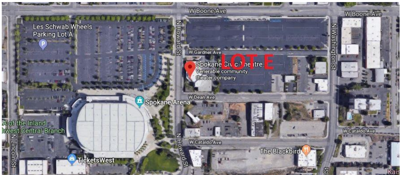
Spokane Arena / Diamond Parking East Lot